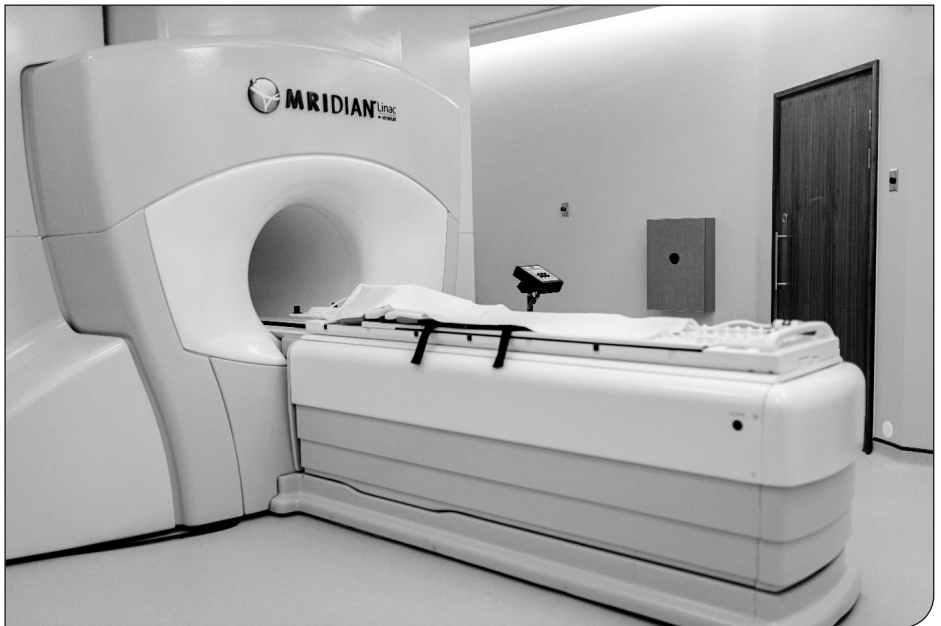
Photo of the MR Linac in Oxford

The Oxford University Hospitals NHS Foundation Trust and the University of Oxford are working in partnership with GenesisCare to make radiotherapy treatments on an MR Linac available to Oxford NHS patients at their centre in Oxford.