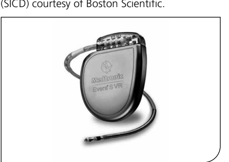
Implantable Cardiac Defibrillator