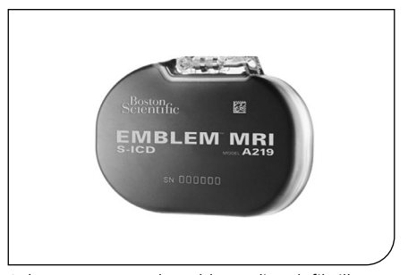
Subcutaneous Implantable cardiac defibrillator. (SICD) courtesy of Boston Scientific.

Your consultant at your local hospital is: